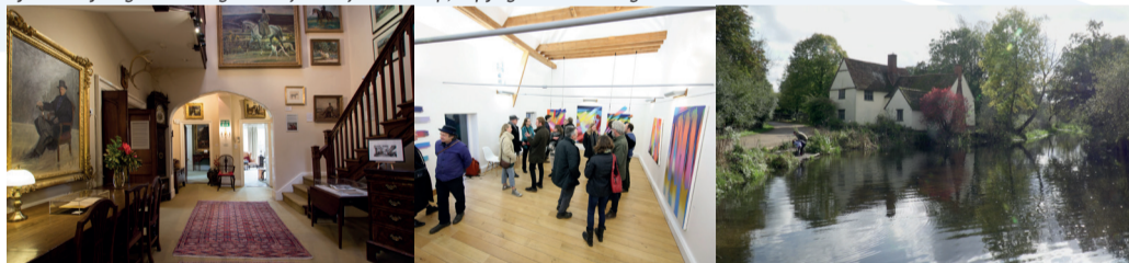
Left: Main Hall, The Munnings Art Museum, Centre: Visitors enjoying an exhibition at Mill Tye Gallery and Arts Centre. Right: Willy Lott's House at Flatford, which appears in several Constable Paintings

1 John Constable John Constable (1776-1837) is a true East Anglian artist and unquestionably one of the world's finest landscape painters. He was born in East Bergholt and spent much of his time in the countryside near his home. It was here he developed a love of painting and drew inspiration from his beloved Suffolk and Essex landscapes, which sustained him creatively for the rest of his life. His paintings of the Dedham Vale made him one of the most famous landscape artists of the 19th century. Constable's first great success (which brought him recognition by the Royal Academy) was with A Boat Passing a Lock painted at Flatford. Other notable works include his depiction of Dedham Church and The Hay Wain , both reflecting rural scenes around the River Stour. In later years, he wrote nostalgically: "all those things that lie on the banks of the Stour, they made