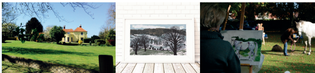
Left: The Munnings Art Museum, Castle House with Studio. Centre: Visitors have the opportunity to purchase featured art at Mill Tye Gallery. Right: Painting Horses from Life Workshop