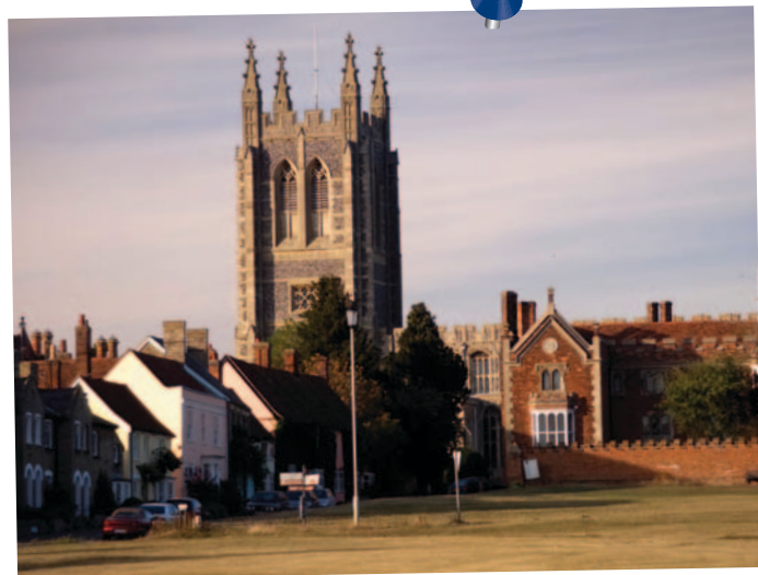
Long Melford Church and Green

Sudbury's ancient Common Lands, yellow with buttercups in early summer, provide an attractive approach to the bustling market town, famous for its connection with artist Thomas Gainsborough. The barge traffic depicted in many of John Constable's paintings came here and the former quayside warehouses have survived to become headquarters of the River Stour Trust and a vibrant theatre. The town has ample choice of accommodation, places for refreshment as well as train and local bus services. On the Essex side of the valley the Path climbs to high ground where the landscape is pleasantly undulating and remote.