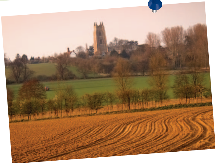
View of Stoke-by-Nayland

At Low Lift, water from the Stour is abstracted for transfer to south Essex. A raised footbridge over a weir leads to the old main road through Stratford St Mary and is also the viewpoint of Constable's 'Stratford Mill' of 1820, popularly known as 'The Young Waltonians'. The low-lying meadows either side of Stratford St Mary may be flooded in winter.