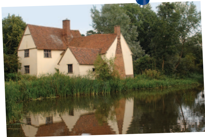
Willy Lott's House

The waters of the famous mill pool are no longer tidal, but the air has a distinctly salty tang as the Path crosses the marshes towards the estuary at Cattawade. Manningtree station is nearby.