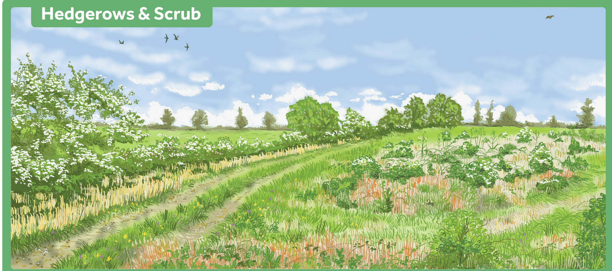
Design and illustration © wearedrab.co.uk