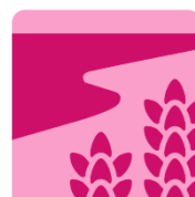
Suffolk & Essex Coast & Heaths National Landscape