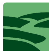
Dedham Vale National Landscape & Stour Valley

National Landscape Office Saxon House Whittle Road Hadleigh Road Industrial Estate IPSWICH IP2 0UH